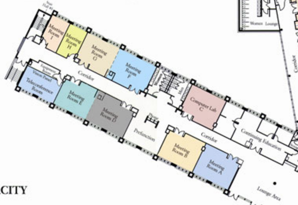
FIRST FLOOR MEETING ROOM WING